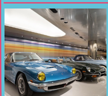
The Prince Albert Luxury Car collection