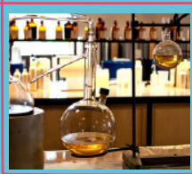
Fragonard Perfumery and perfume creation