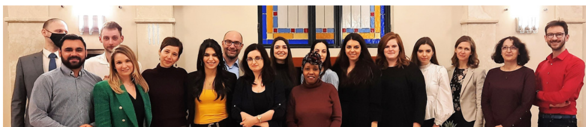
The CommSci community